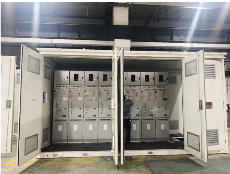
Secondary collector station (MV substation kiosk)

Our representatives service the renewables, utilities, infrastructure, oil and gas, and mining industries with power conversion and distribution solutions to suit their project timeframes and budgets. We use our deep understanding of power engineering and manufacturing to offer world-class renewable energy products.